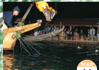
Cormorant Fishing on the Nagara River