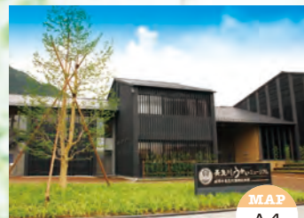
Nagaragawa Ukai Museum

Tel: 058-262-0104 (Cormorant Fishing Viewing Boat Office) Operation: 5/11~10/15 every year (Start around 19:30) Exception: Harvest moon festival and during flood Fare: ¥3,200~/Adult ¥1,800/Child