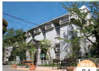
Nawa Insect Museum