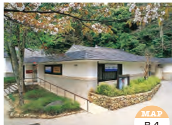
Kato Eizo & Toichi Memorial Art Museum

Free for the disabled and their caregiver.