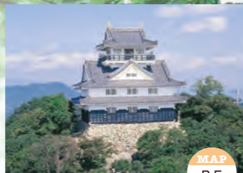
Gifu Castle (Gifu Castle Museum)

Free for the disabled and their caregiver.