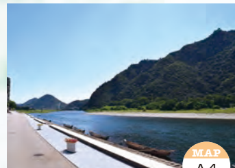
Nagara River Promenade / Cormorant Fishing Village

Free for the disabled and their caregiver.