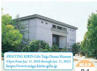
Gifu City Museum of History

The Mt. Kinka is a symbol of Gifu City. Whole Mountain of 329 m from sea level is covered by natural forests as if a natural museum. There exist Gifu Castle at its peak and Gifu Park at its foot so that it can constitute a scenic zone together with the clean the Nagara River. The "Gifu Castle Ruins," which includes Gifu Castle and Mt. Kinka, was designated as a national historical site in February 2011.