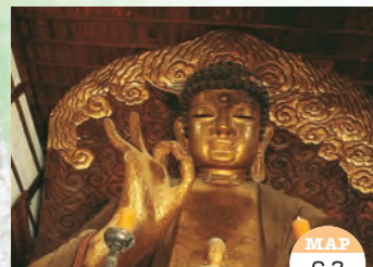
Gifu Great Buddha (Shobo-ji Temple)

Esplanade of 1.3 km along the Nagara River upstream from the Nagara bridge while facing to Mt. Kinka and Gifu Castle as well as watching the cormorant fishing in the night. At the right bank of the Nagara River, six fishing masters still spend their daily lives here. The cormorants and firewood can be closely observed.