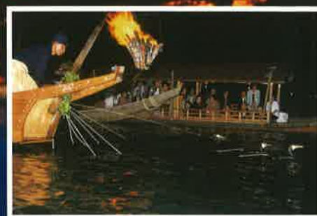
Cormorant fishing viewing (image)

Want to know more about the Nagara River cormorant fishing?