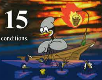
Mascot of Gifu Nagara River Cormorant Fishing, "Ooh-tan"

* The time schedule is subject to change due to the weather conditions, number of boats, other events, etc.